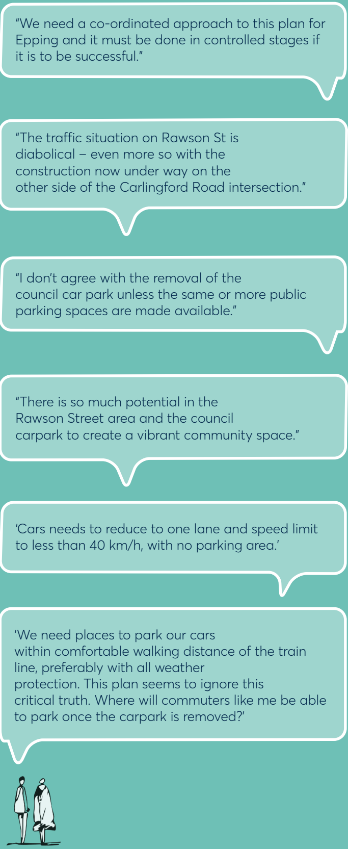
Community quotes from online survey