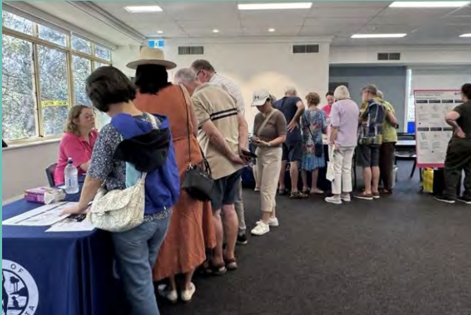
Boronia Grove Community Centre drop-in session