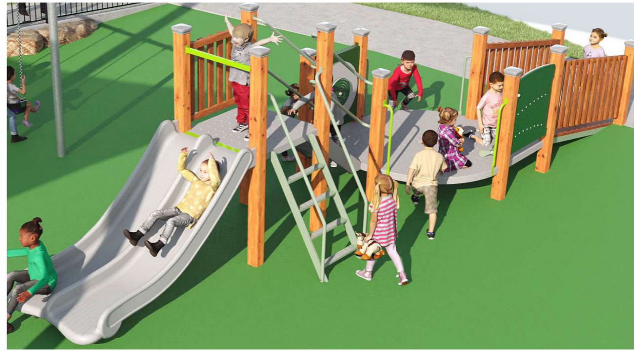
5 Double slides