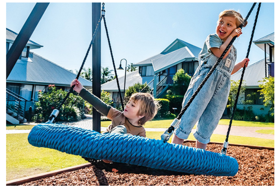
4 Nest seat swing