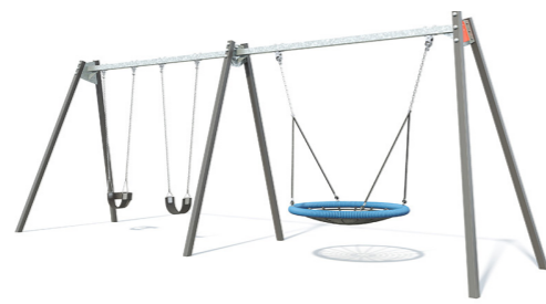
④ Proposed triple swings set with a nest seat, a standard seat and a toddler seat.