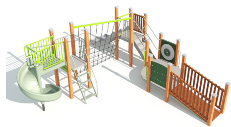
⑤ Proposed double slides and spiral slide play equipment.