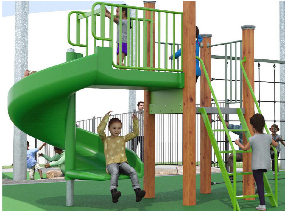
5 Spiral slide