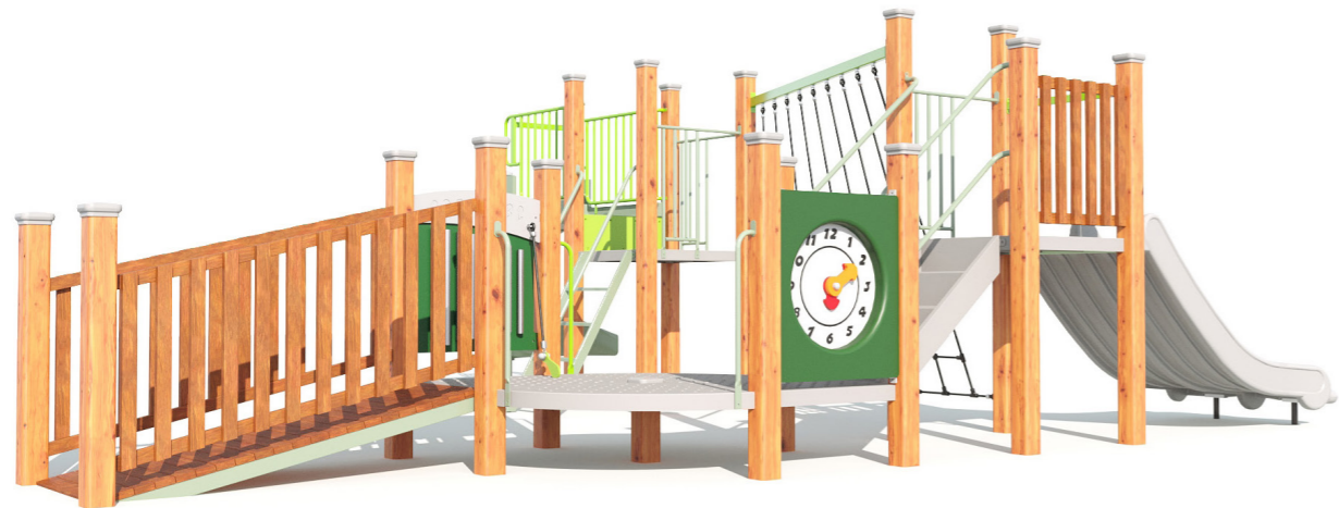
5 Proposed play equipment with accessible ramp