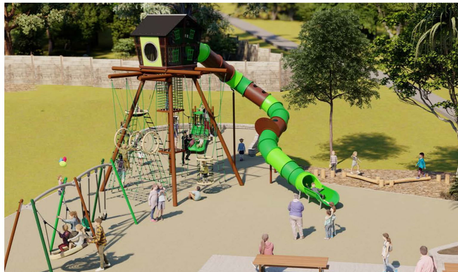
Artist Impression of Play Equipment. Please note that layout of the playground and play equipment are indicative only. Final layout and equipment may change.