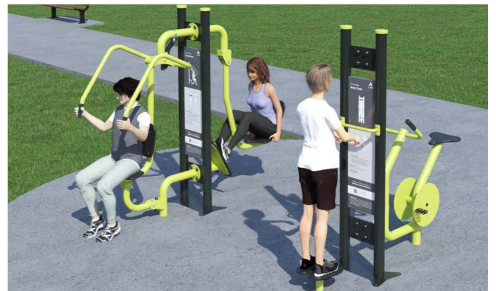
Artist Impression of Fitness Equipment. Please note the layout and equipment are indicative only. Final layout and equipment may change.