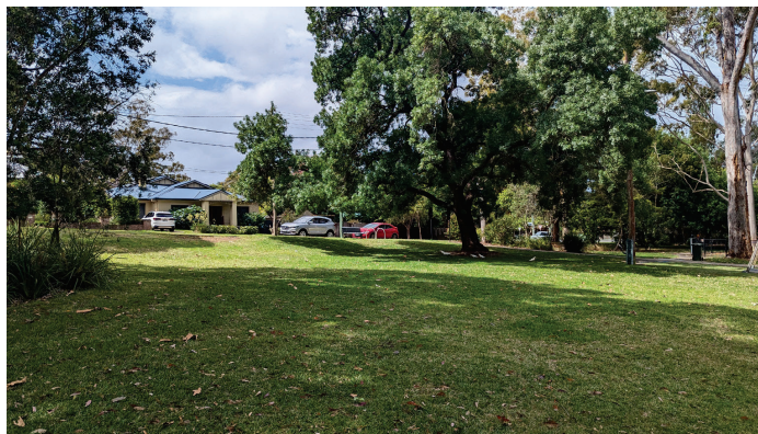
Proposed playground location with view of Wyralla Ave