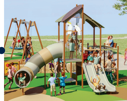
4 Capital-Geoclimber Multiplay Unit