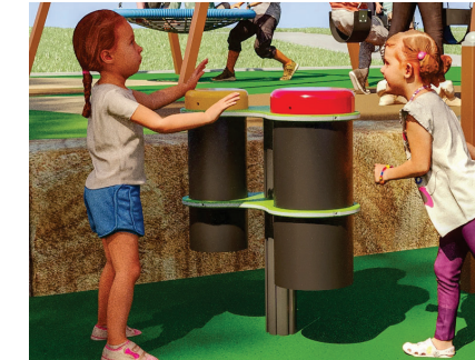
3 Virtuoso Bongo Trees