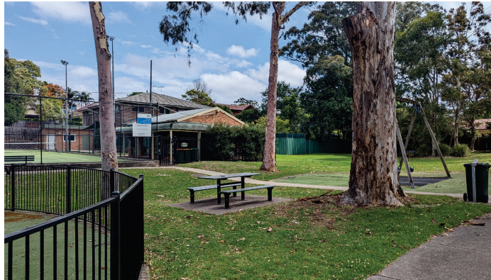
View of existing picnic table from fenced playground