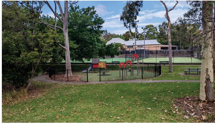
Existing fenced playground