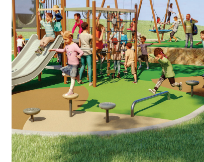
5 Balance Trail