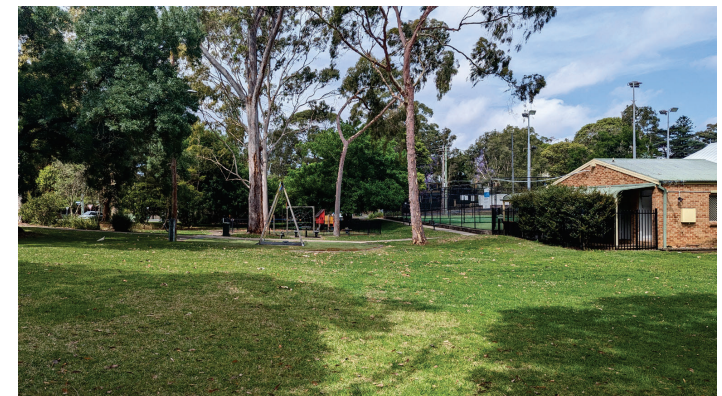
Proposed relocation of playground (west of existing playground)