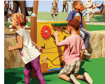
2 Australian Bush Story