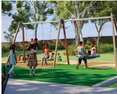
1 Capital Triple Swing

The busy board and bongos will bring imaginative and sensory play to the playground.