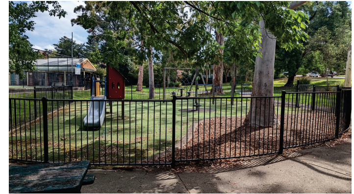
Existing fenced playground