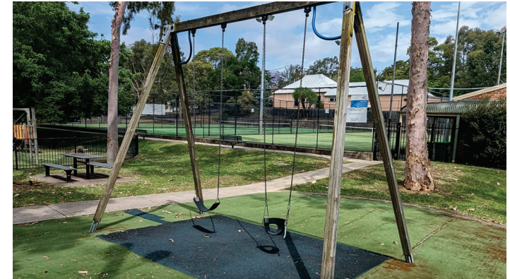
Existing swingset separate from fenced playground