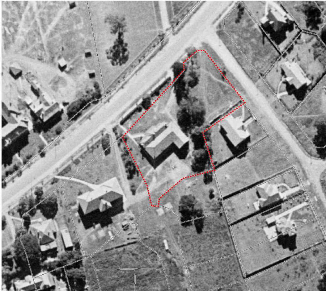
Figure 5: 1943 aerial photograph over the site. Site outlined in Red.

Burnside Presbyterian Orphan Homes changed its name to Burnside Presbyterian Homes for Children in 1955, in recognition of the fact that most children in the home were not orphans.