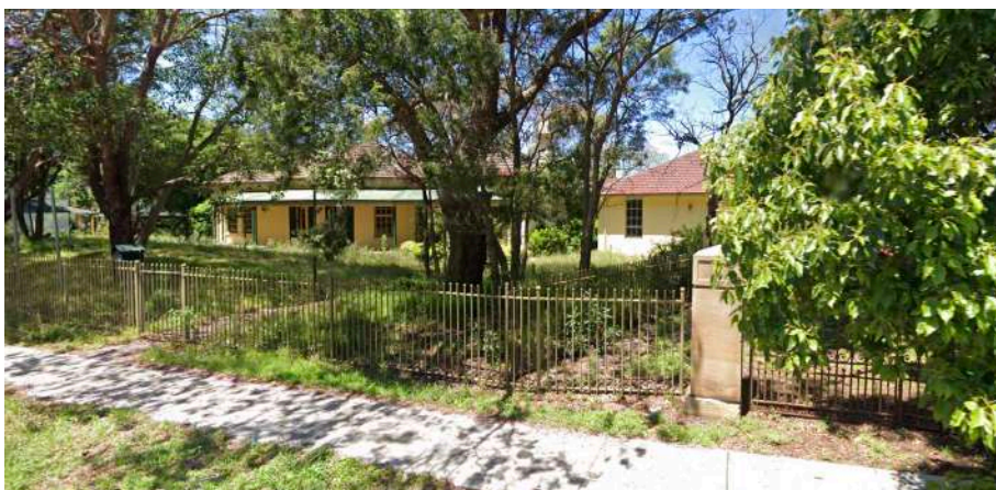
Figure 1: The site as seen from Pennant Hills Road. Google images. 2021.

This Heritage Impact Statement letter (HIS) has been prepared in conjunction with a Planning Proposal to change the land zone of No. 8 Lincluden Place from SP2: Infrastructure to R2: Low Density Residential.