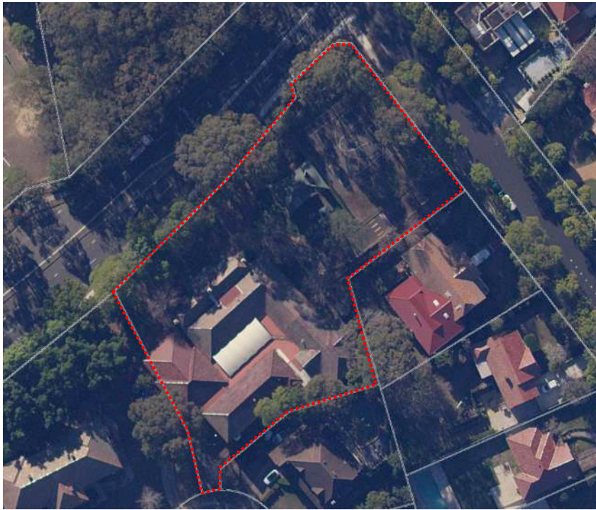
Figure 3: The site outlined in white. Six Maps.2021. Site outlined in red.