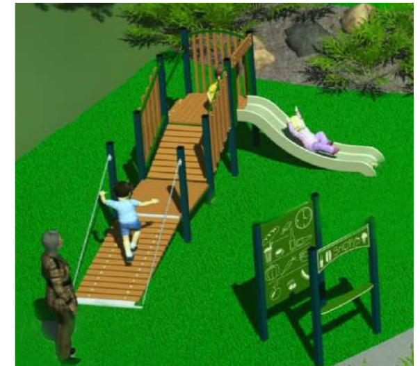
Proposed play unit with double slide