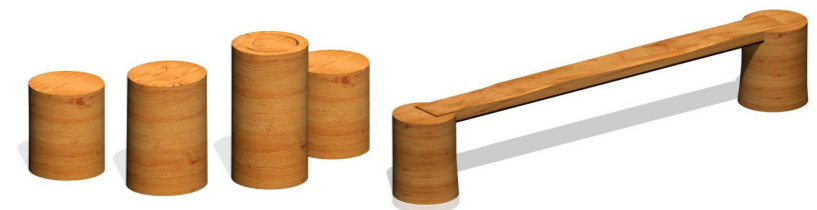
Proposed wooden logs and balance beam