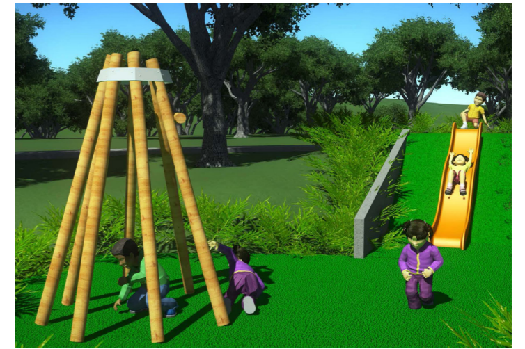
Proposed Teepee & embankment slide