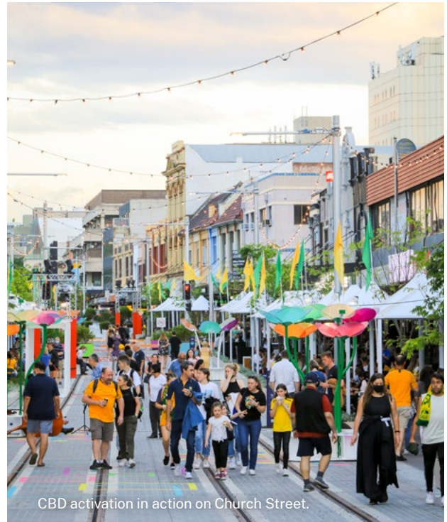
CBD activation in action on Church Street.

Check out the latest campaigns and activations. Find out more, visit activateparramatta.com.au .