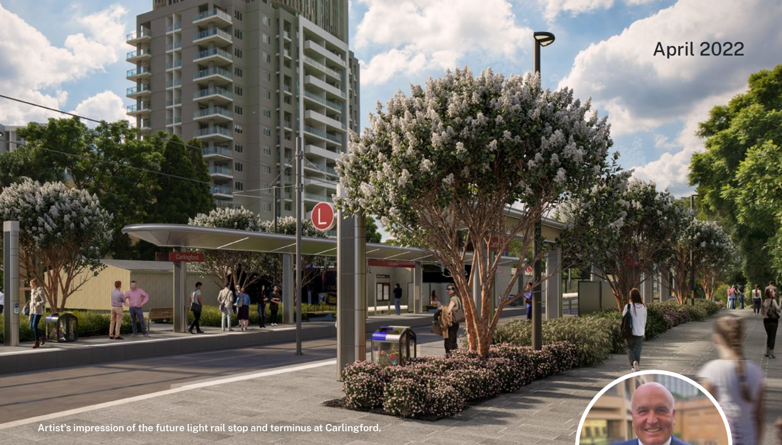
Artist's impression of the future light rail stop and terminus at Carlingford.