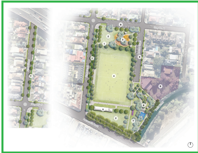
Stage 1 Master Plan adopted by Council 16 December 2019