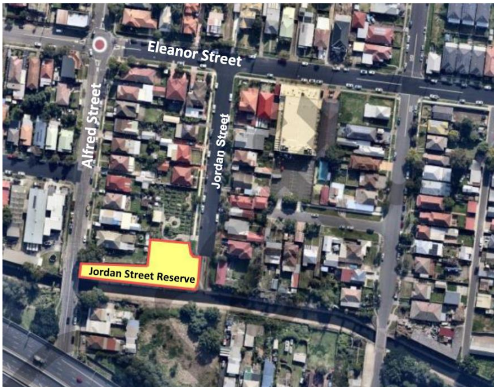
Image 2: Yellow shaded area indicating closed sections of Jordan Street Reserve, Rosehill

Areas where contaminated materials were present beneath the soil were closed as a precautionary measure. These areas were fenced to limit soil disturbance, prevent public access and possible physical contact with any potential contaminants that pose a contact risk ( see closed areas in map below).