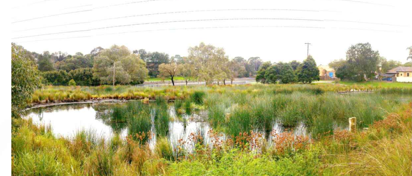
Proposed Wetland To Improve Water Quality, Provide Habitat and Create a Unique Community Space (Cup and Saucer Wetland)