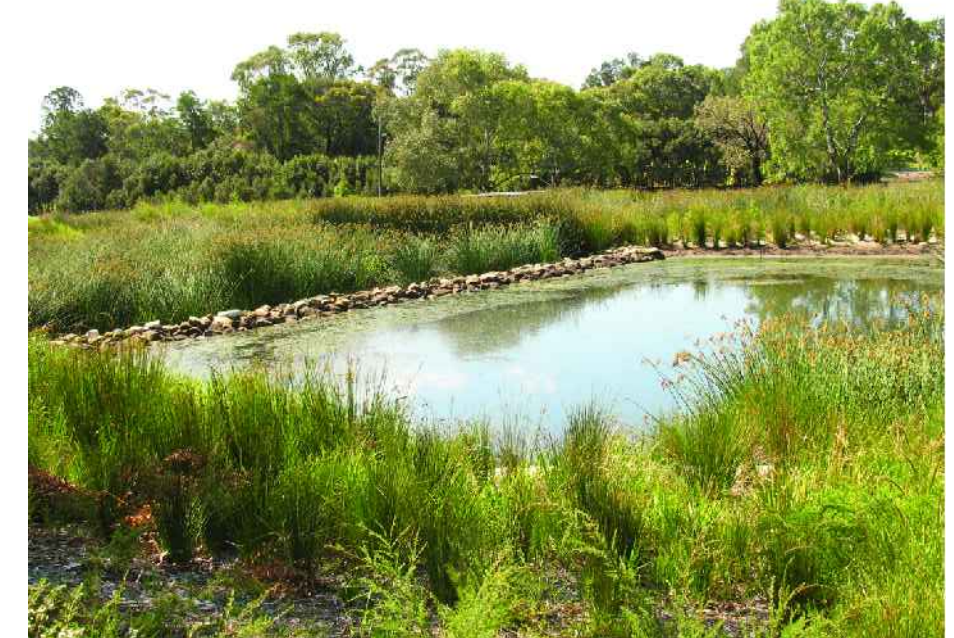
Proposed Wetland (Cup and Saucer Wetland)