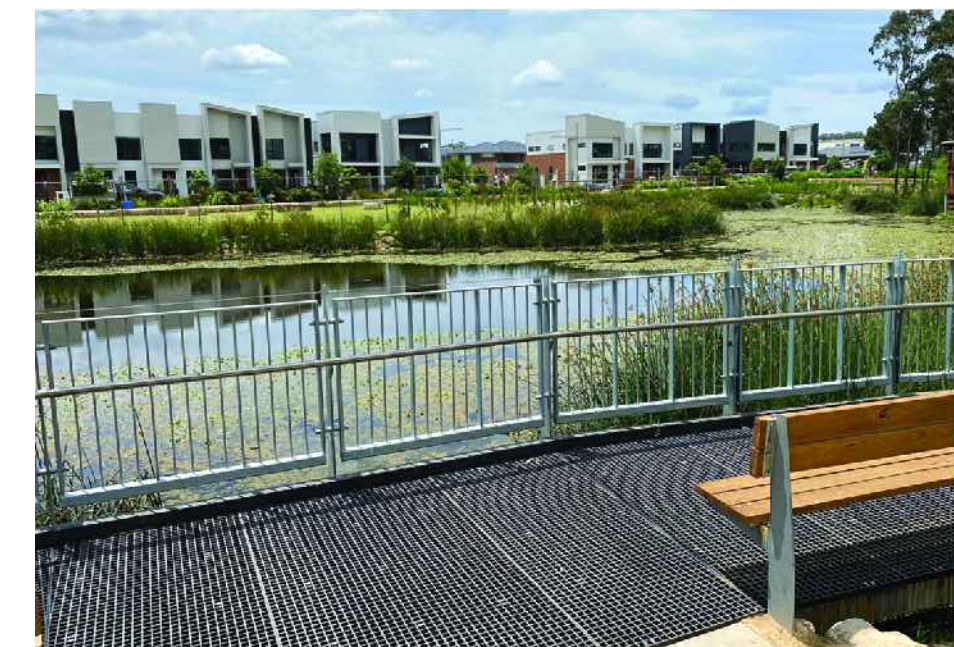
Proposed Wetland Viewing Deck (TBLD Willowdale Riparian Corridor)