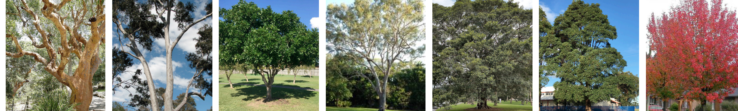
Angophora costata Corymbia maculata Cupaniopsis anacardioides Eucalyptus tereticornis Ficus rubiginosa Lophostemon confertus Pyrus calleryana 'Bradford'