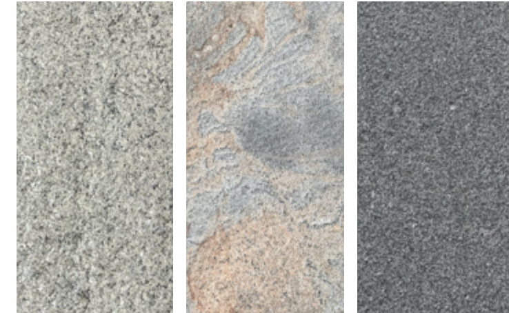
Austral Verde Bruce Rock (Austral Juparana) Adelaide Black (Austral Black)