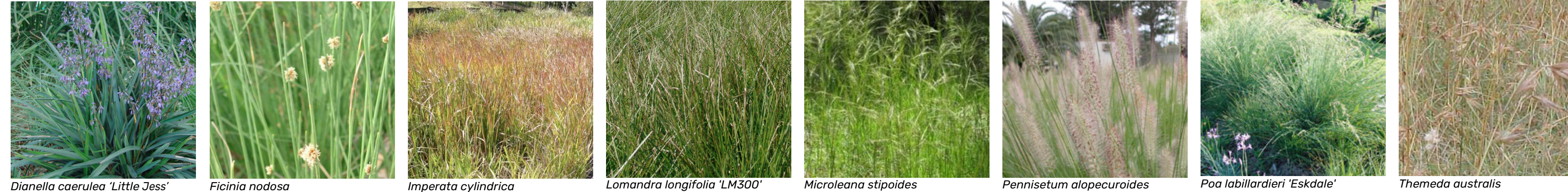
Dianella caerulea 'Little Jess' Ficinia nodosa Imperata cylindrica Lomandra longifolia 'LM300' Tanika Microleana stipoides Pennisetum alopecuroides 'PA300' Nafray Poa labillardieri 'Eskdale' Themeda australis