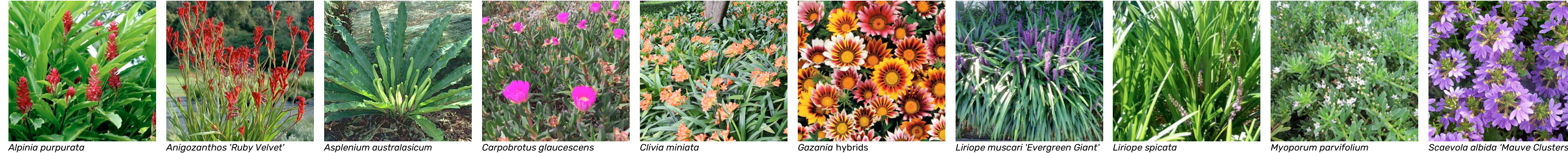
Alpinia purpurata Anigozanthos 'Ruby Velvet' Asplenium australasicum Carpobrotus glaucescens Clivia miniata Gazania hybrids Liriope muscari 'Evergreen Giant' Liriope spicata Myoporum parvifolium Scaevola albida 'Mauve Clusters'