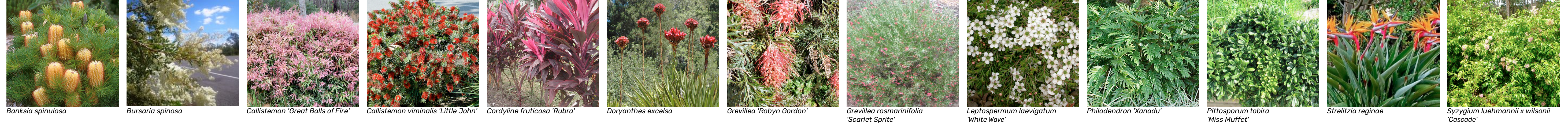
Banksia spinulosa Bursaria spinosa Callistemon 'Great Balls of Fire' Callistemon viminalis 'Little John' Cordyline fruticosa 'Rubra' Daryanthes excelsa Grevillea 'Robyn Gordon' Grevillea rosmarinifolia 'Scarlet Sprite' Leptospermum laevigatum 'White Wave' Philodendron 'Xanadu' Pittosporum tobira 'Miss Muffet' Strelitzia reginae Syzygium luehmannii x wilsonii 'Cascade'