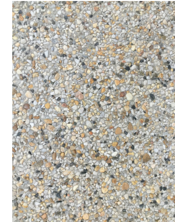
Exposed aggregate finish