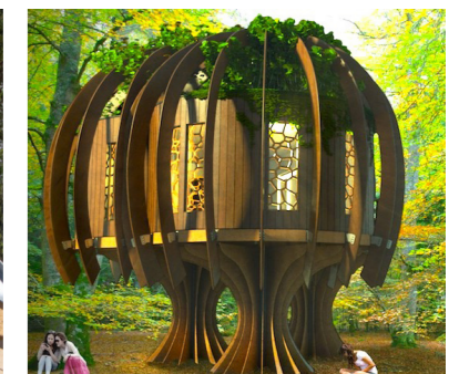
Play equipment inspiration