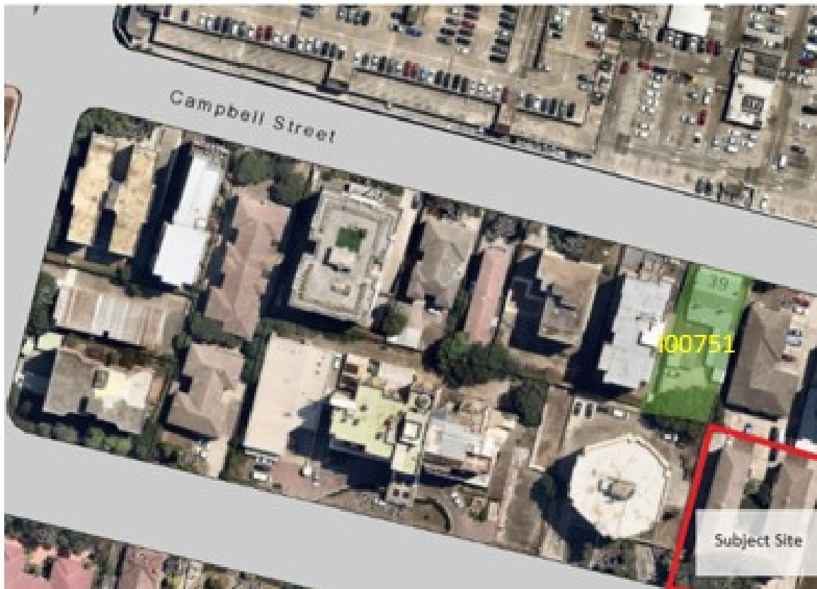
Figure 1: An aerial image of the site and surrounds (subject site outlined in red, adjacent planning proposal at 87 Church Street & 6 Great Western Highway outlined in orange, state heritage items in green).