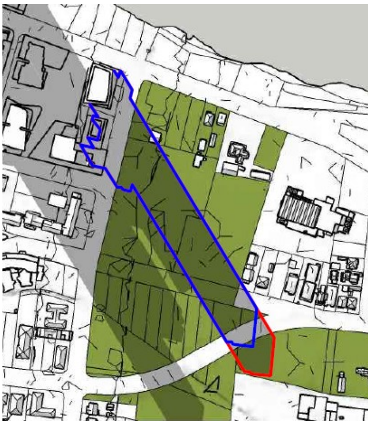
Figure 4: overshadowing caused by the Albion Hotel site at 2pm on 21 June. (Blue line reflects shadow profile of 149.5m tower. Red line reflects shadow profile of 166m tower).