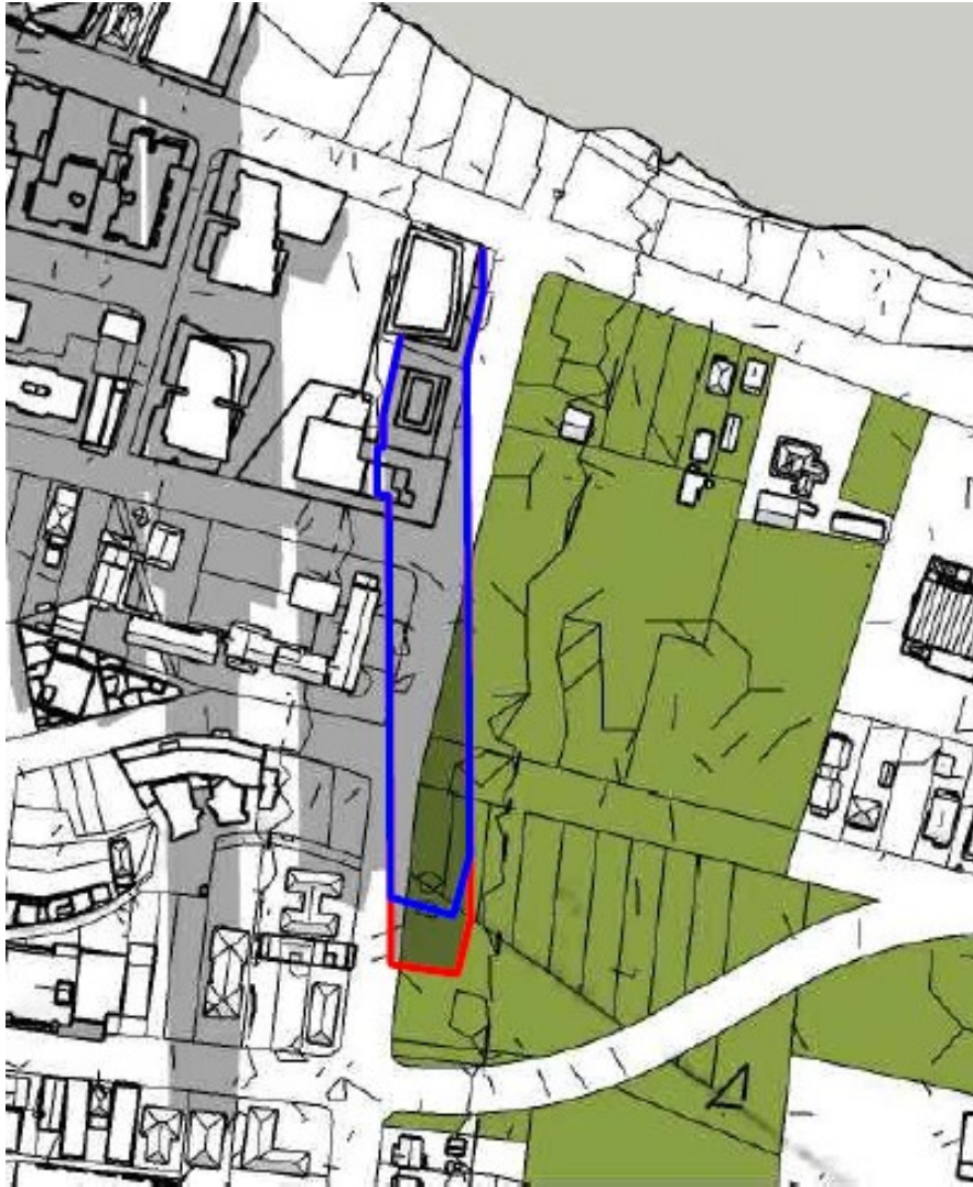
Figure 2: overshadowing caused by the Albion Hotel site at 12pm on 21 June. (Blue line reflects shadow profile of 149.5m tower. Red line reflects shadow profile of 166m tower).