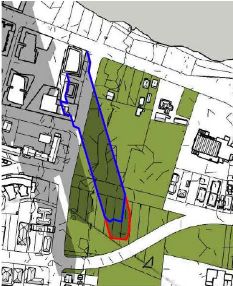
Figure 3: overshadowing caused by the Albion Hotel site at 1pm on 21 June. (Blue line reflects shadow profile of 149.5m tower. Red line reflects shadow profile of 166m tower).