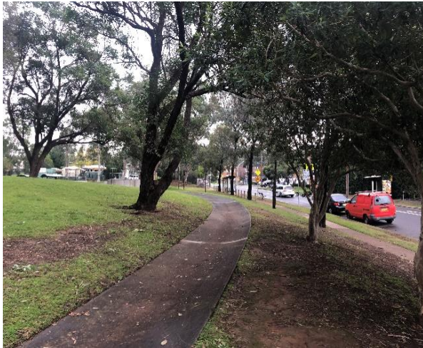
Figure 14: View north along eastern boundary of park showing slope, visible soils and concrete bike track.