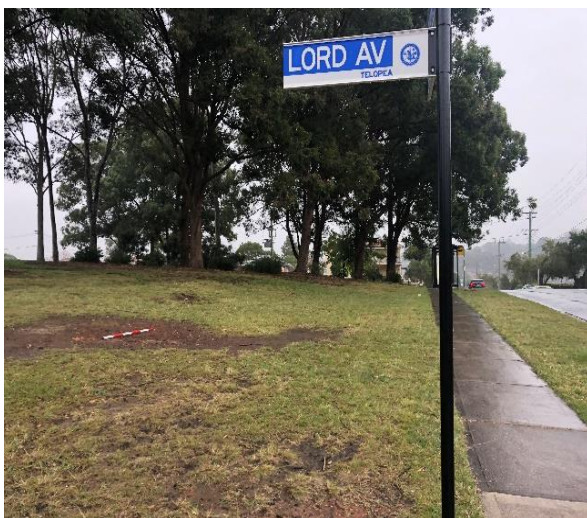
Figure 7: View west across likely AHIMS site ‘Acacia Park’ (AHIMS 45-6-2407)

As detailed in the site card, the area at the corner of Lord Avenue and Evans Road was investigated for artefacts, none were located and there was no visible evidence of shell, bone or charcoal. All exposed ground in this location was examined for evidence of AHIMS site ‘Acacia Park’ (AHIMS ID 45-6-2407). The area is heavily disturbed from previous land use, vegetation clearance, construction and excavation work for the adjacent roads and footpath. The surface was covered in shale gravels and blue stone gravel, it is possible the silcrete artefacts were mis-diagnosed or imported. This site is listed as ‘valid’, however, there is little potential for archaeological deposits to be located at this site.