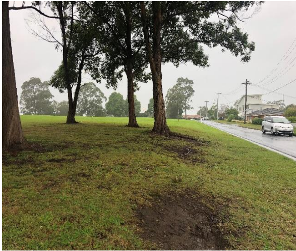
Figure 9: View south along west boundary of park showing slope, trees and ground visibility.