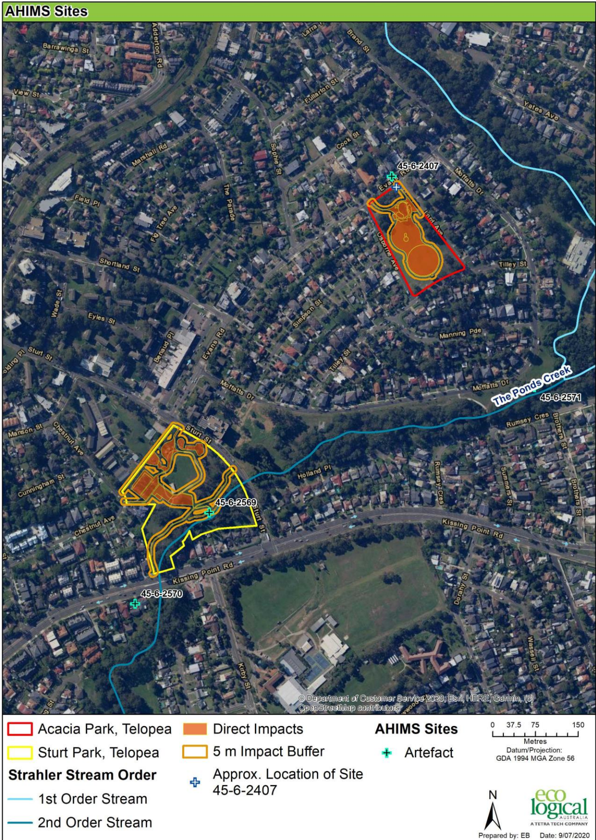
Figure 5: AHIMS sites within and in close proximity to the study areas