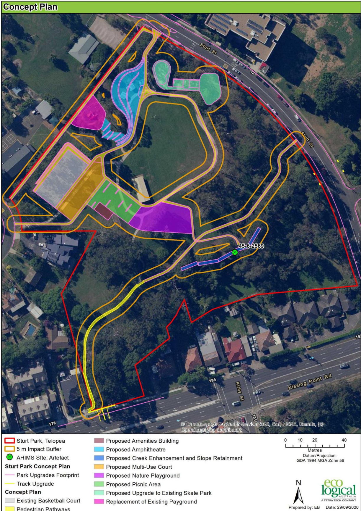
Figure 3: Sturt Park – location, proposed upgrade footprint and recorded Aboriginal site