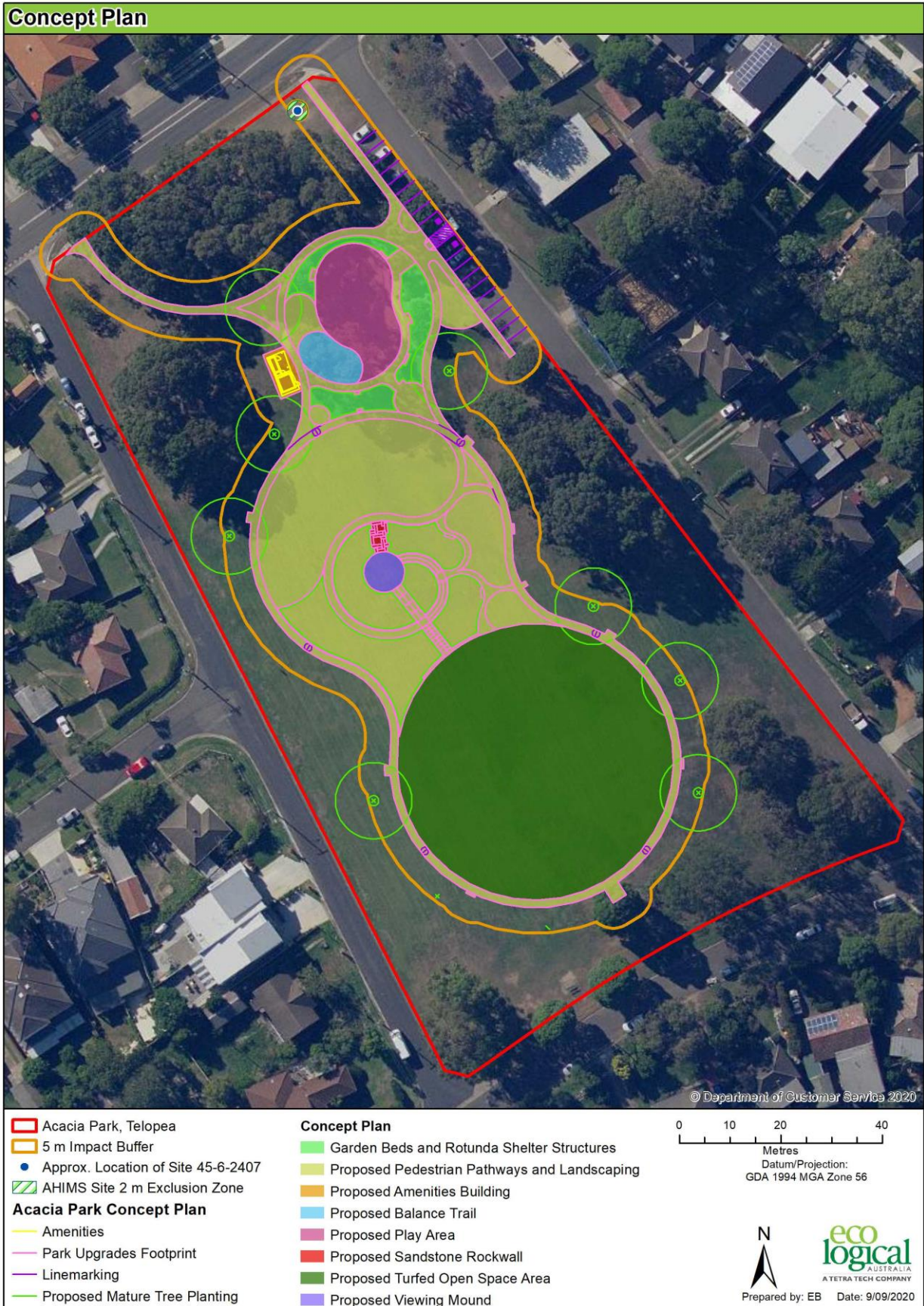
Figure 2: Acacia Park – Proposed upgrade footprint and 5 m impact buffer. The registered site is in the top right corner