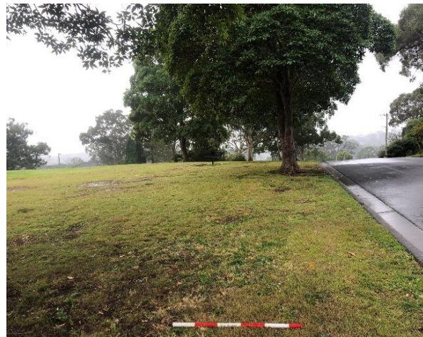
Figure 12: View east along southern boundary of study area showing trees and grass cover.