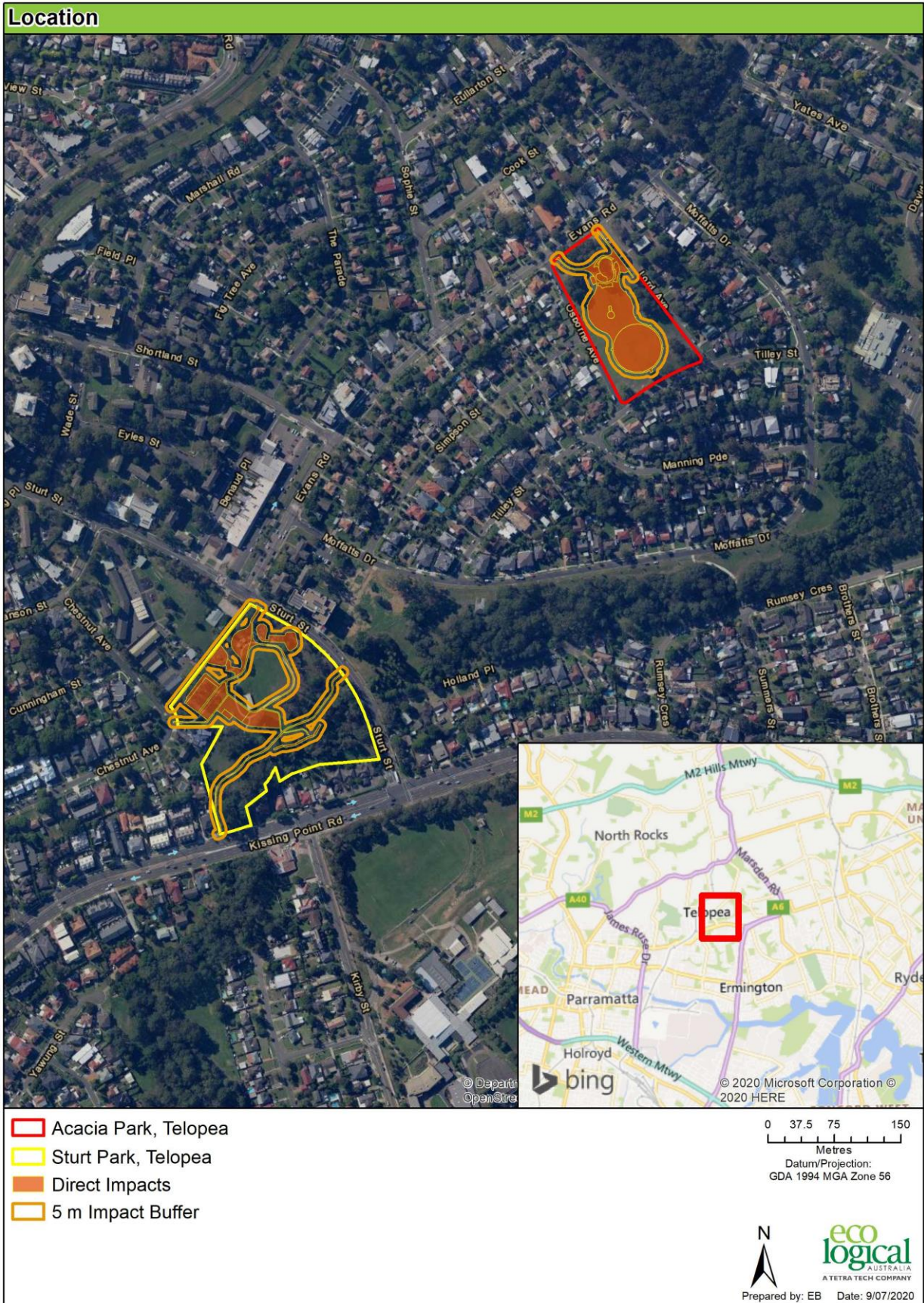
Figure 1: Location of Sturt and Acacia Parks showing areas of proposed work