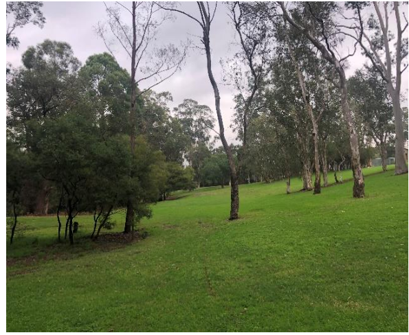
Figure 15: View west across AHIMS ID 45-6-2569, showing slope and dense grass cover.