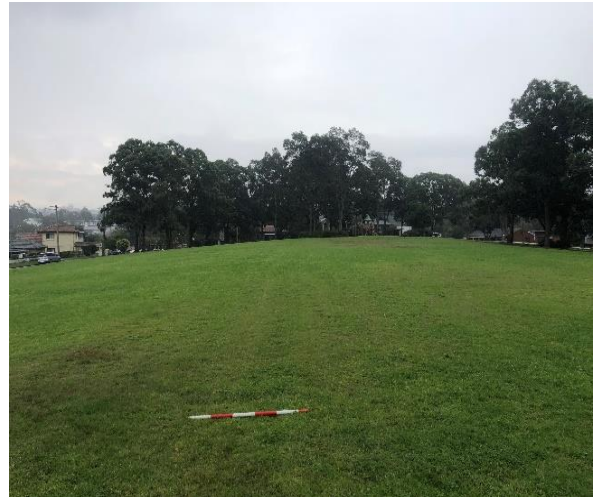
Figure 10: View north along the middle of the park, showing the crest is well grassed and the play equipment is located in the north east corner.