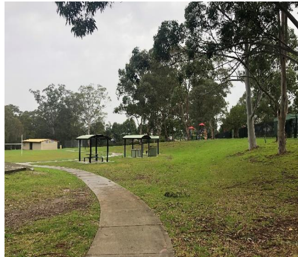
Figure 19: View west from eastern boundary showing paths, BBQ facilities and toilets.