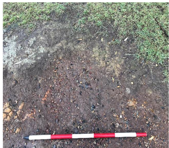
Figure 8: Soil exposure at the possible location of AHIMS 45-6-2407, visible shale, gravel and introduced materials