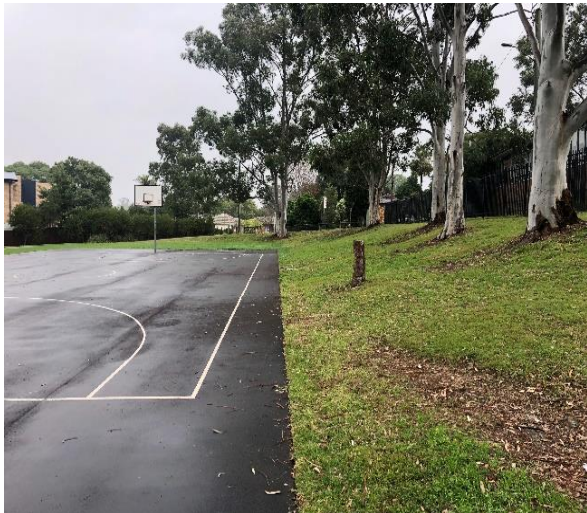
Figure 18: View west along north boundary of study area showing courts and excavated slope.