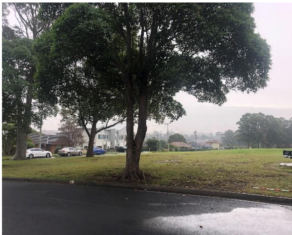
Figure 11: View north west at the south boundary of the study area, showing road, slope, seating and residential housing.