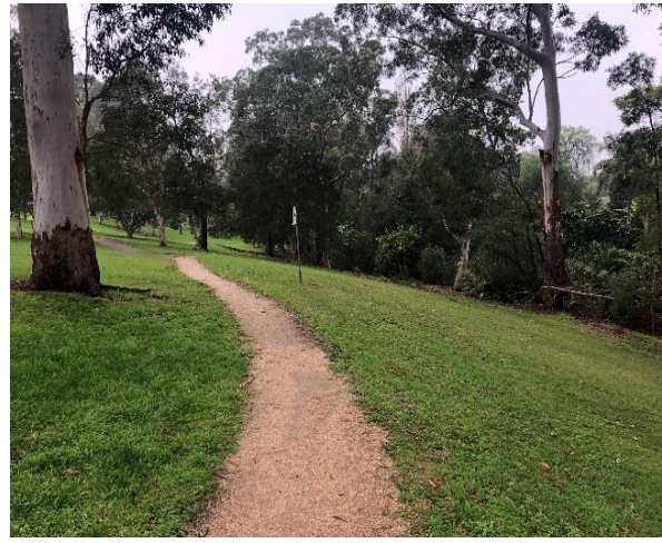
Figure 17: View east showing mature trees, gravel path and vegetation.