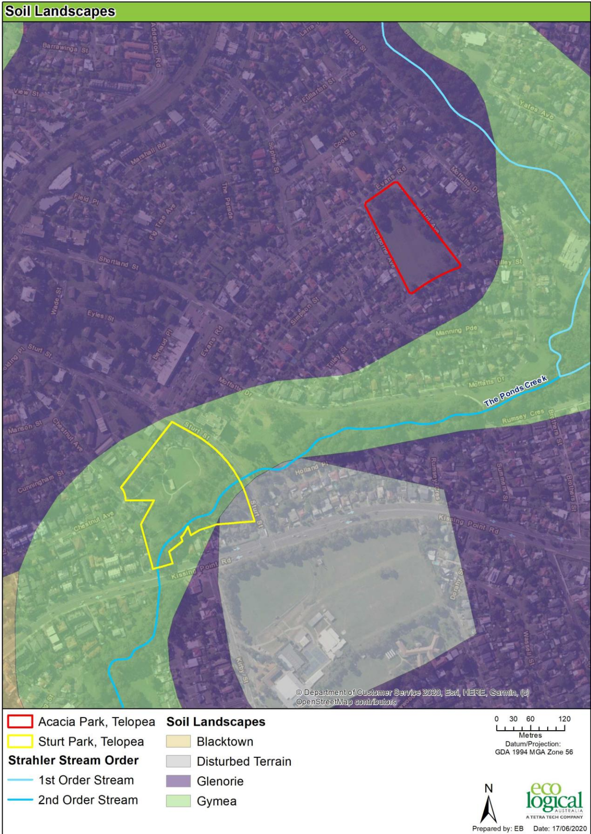
Figure 6: Soil landscapes and hydrology of the study area