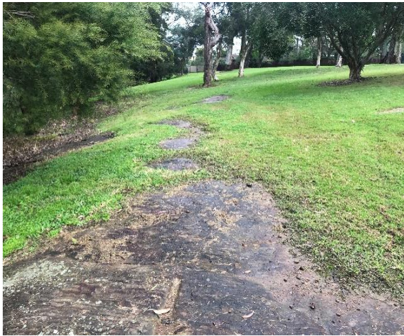
Figure 16: View west above the creek line showing sandstone outcropping and grass cover.