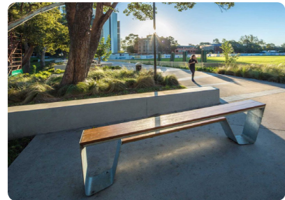
Seating with view to River Mature existing trees to be retained with mulched garden understorey Seating hub