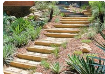
Sandstone steps toward lower area and viewing deck