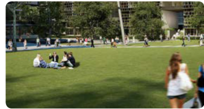
Areas of informal turf in forecourt with mature tree planting to promote placemaking, communal use and user rest stops