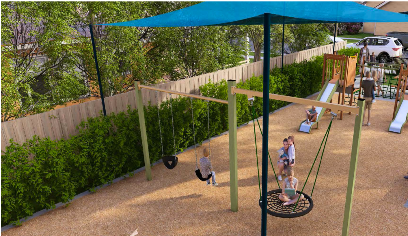
Artist interpretations of play equipment and plant species chosen for the Playground Upgrade.

Note: Exact configuration, materials and finishes are subject to change slightly as documentation progresses.